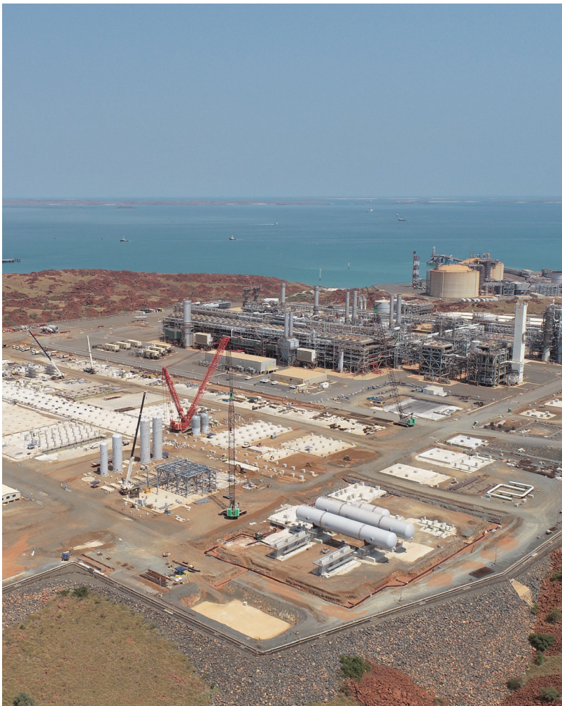
Figure 1 – Pluto Train 2 site

The development of the Scarborough Energy Project will provide a boost to the WA economy and communities, growing jobs and bringing work through the supply chain. The project will also support investment in education, training and jobs.