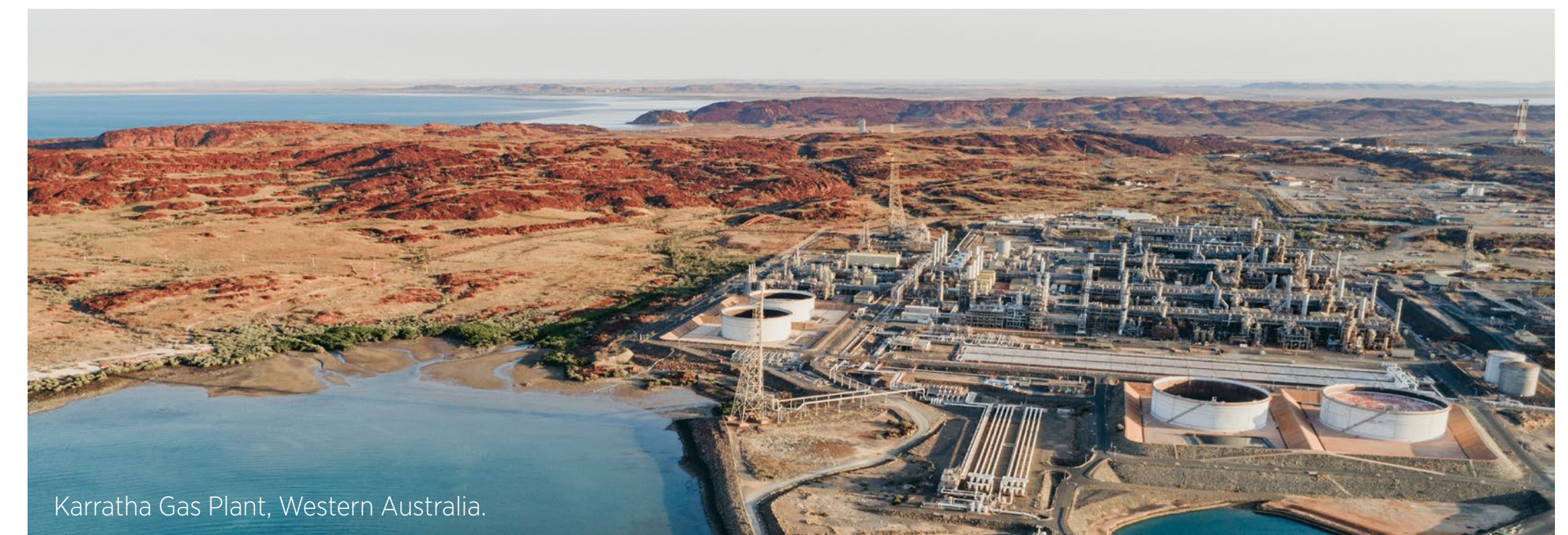
Karratha Gas Plant, Western Australia.

The increased funding is expected to be used to help improve local capability and capacity and tackle the issues and opportunities that are important to our host communities.