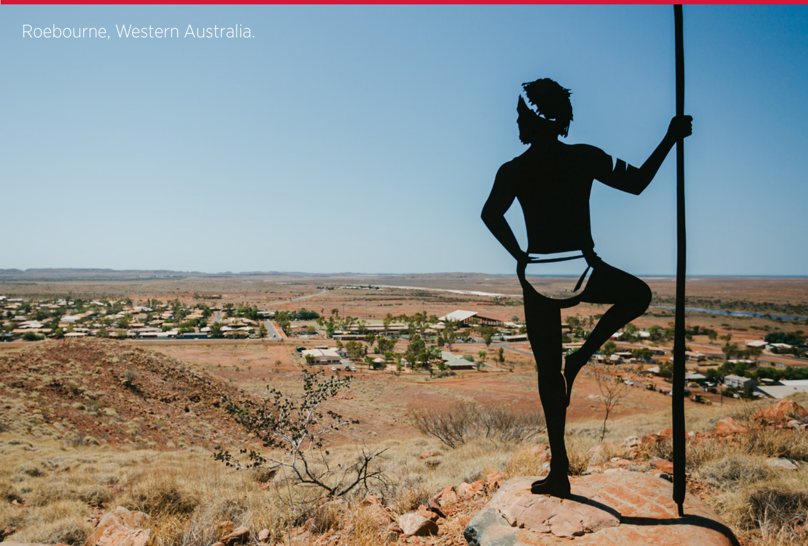
Roebourne, Western Australia.