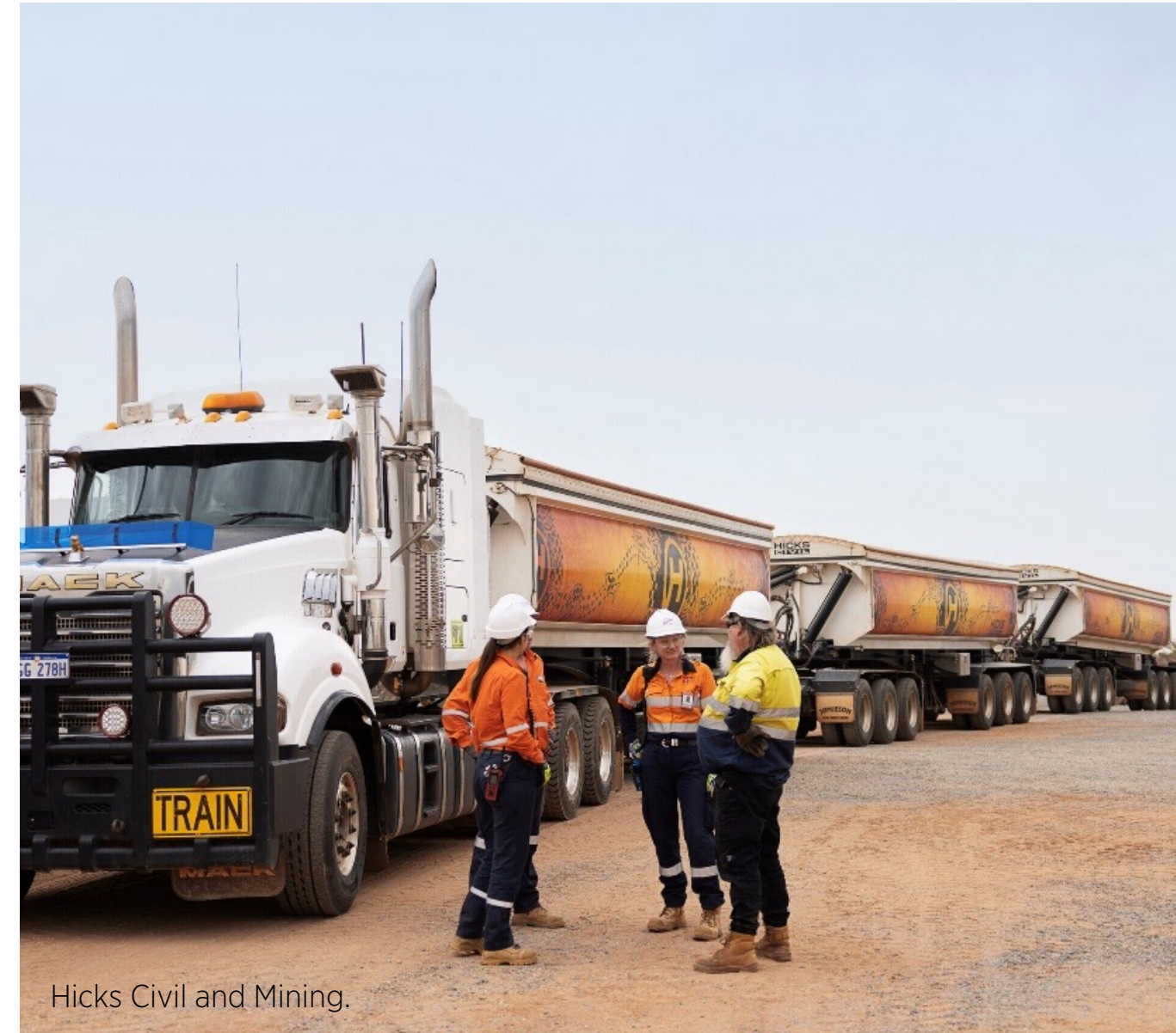
Hicks Civil and Mining.

This partnership exemplifies the project's ongoing commitment to maximising opportunities for local and regional First Nations people and businesses on the Pluto Train 2 Project. Woodside is proud of the lasting positive legacy and contributions this project is making in providing avenues for local businesses to develop.