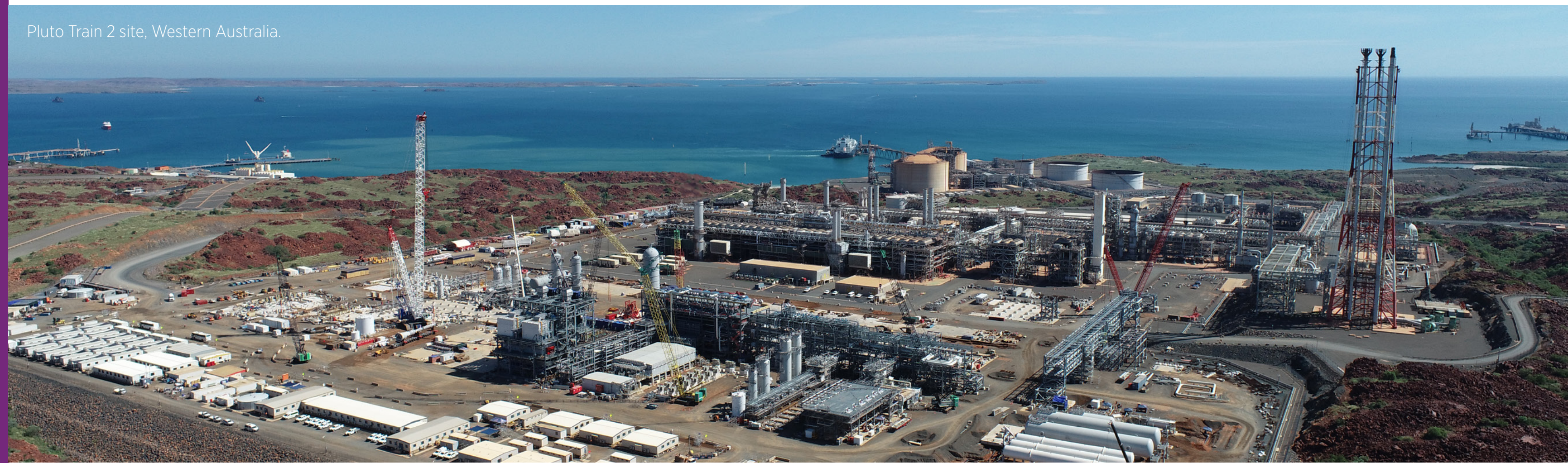
Pluto Train 2 site, Western Australia.

The above statistics are from 1 January 2023 to 31 December 2023.