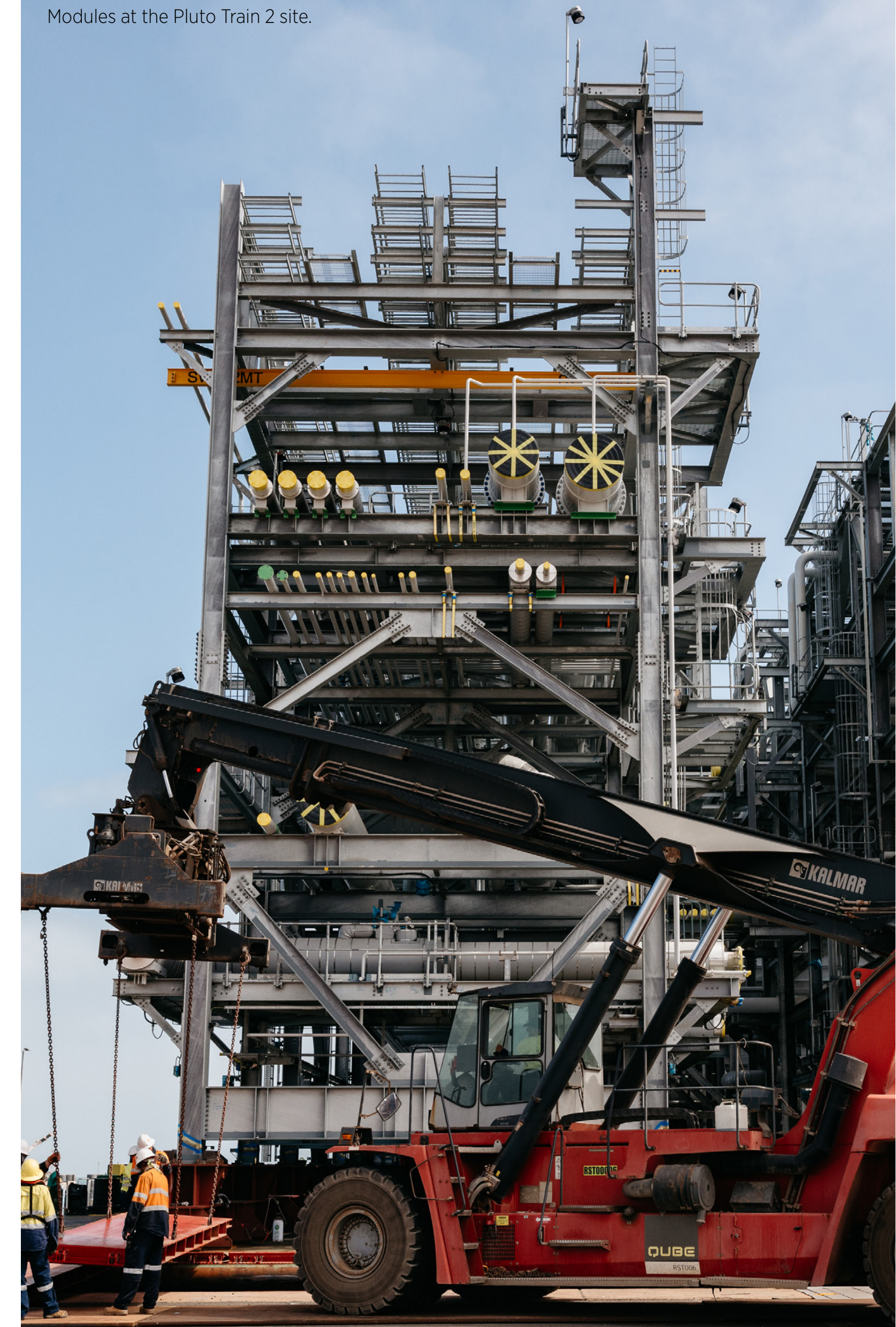
Modules at the Pluto Train 2 site.

— Peter Hicks, Owner of Hicks Civil and Mining.