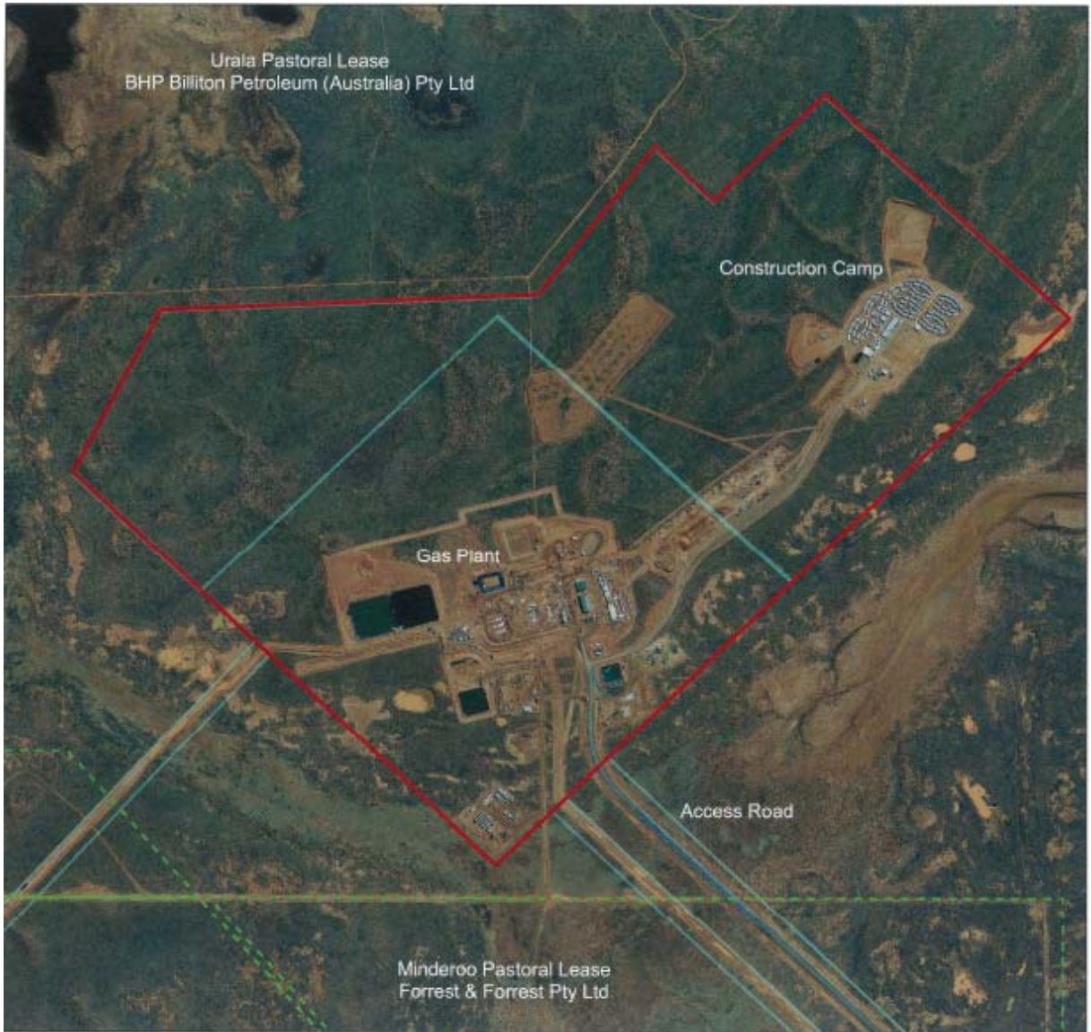
Figure 2 Macedon Gas Plant Lease and Layout