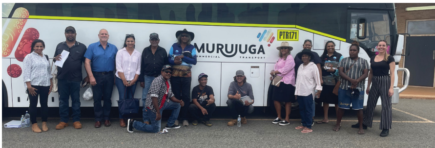
The Ngarla people at the North West Shelf Visitors Centre.

We acknowledge the unique connection that First Nations communities have to land, waters and the environment and seek to consult them in relation to our operations and proposed projects.